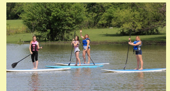
Water conservation is key to preserving our lakes and waterways for recreation and future generations.

Did you know? Overwatering is the leading cause of lawn, shrub, and tree decline! You can use WaterMyYard.org to determine when and how much to water your lawn. For more water-efficient landscaping tips, including plants suited to our region's soil and climate, visit TXSmartScape.com . Together, we can be good stewards of our water while keeping Rockwall beautiful!